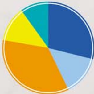
Net sales by geographic segments 2010